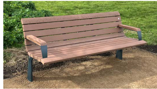
HC2025S Seat (with arms rests)