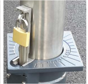
➤ HC101R Retention Socket