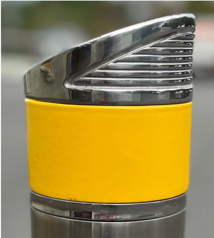
➤ HC2069C Bollard with yellow collar