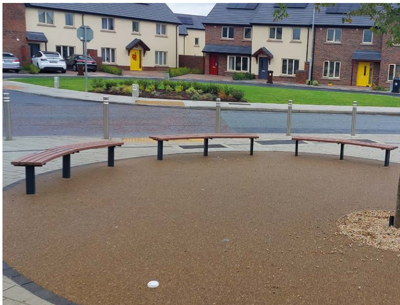
➤ HC2028CB Curved Bench