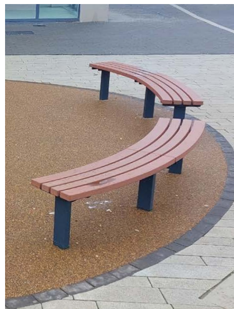
➤ Colour Options