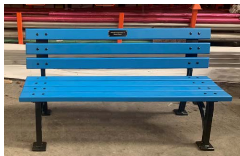
➤ Colour Options