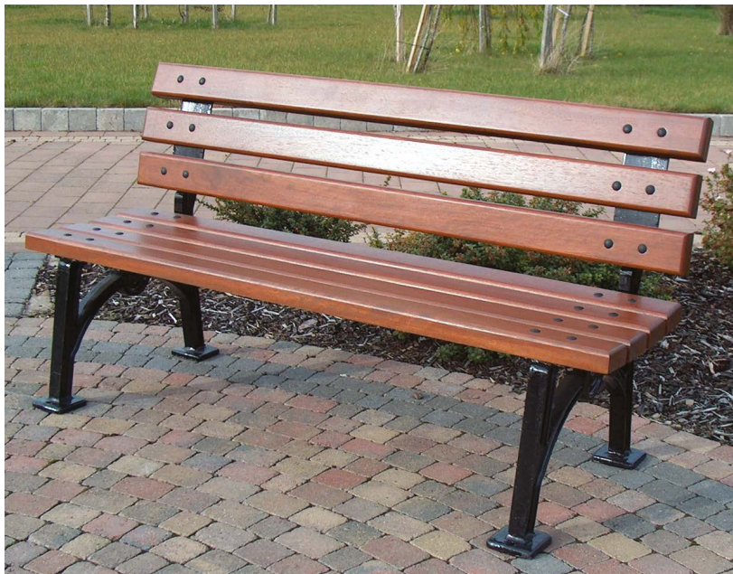
➤ HYDE PARK Seat 5ft