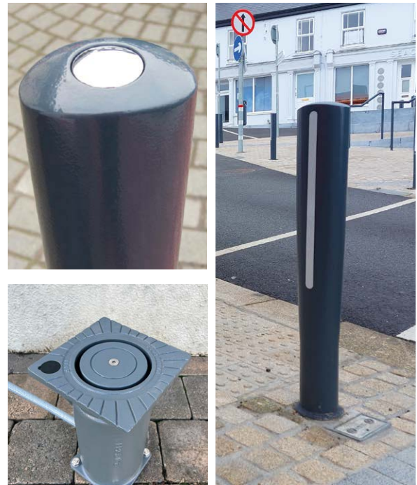
➤ HC114F Ductile Iron Retention Socket