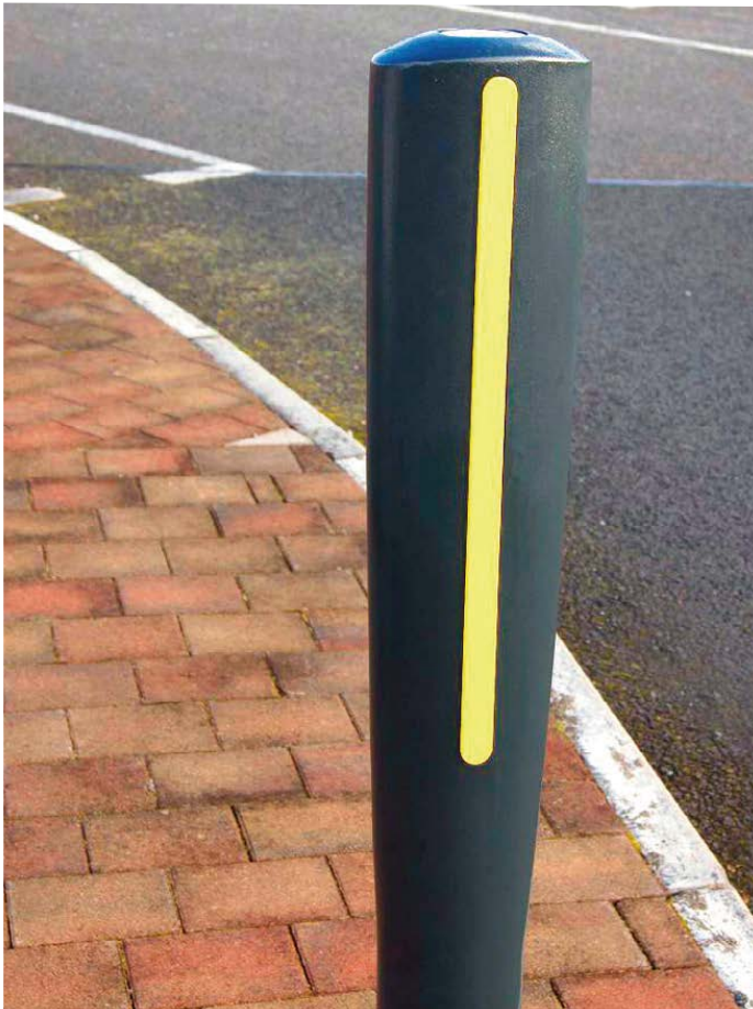
➤ HC2101 Bollard with reflective strip