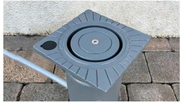
➤ HC114F Ductile Iron Retention Socket