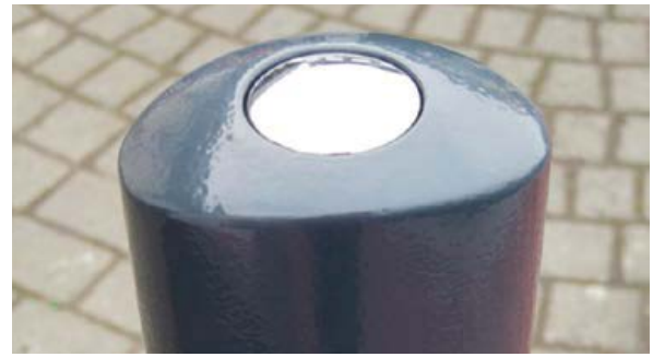
➤ Colour Options