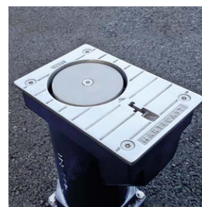
➤ HC114R Stainless Steel Retention Socket