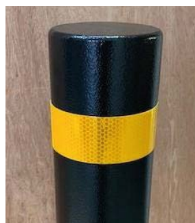
➤ Options Reflective tape