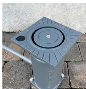
➤ HC114F Ductile Iron Retention Socket