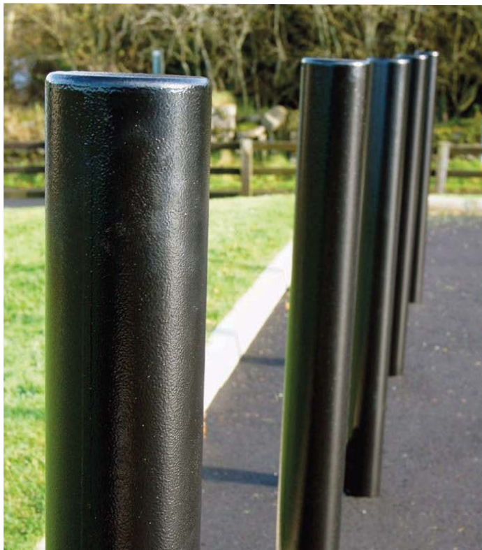
➤ HC2076 Bollard with Flat Top