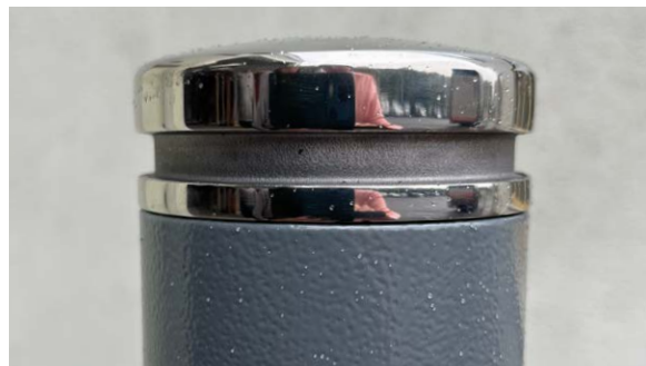
➤ Colour Options