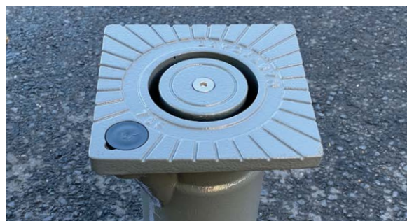
➤ HC76F Retention socket