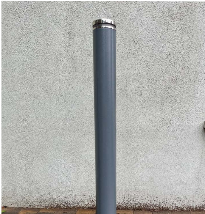
➤ HC2075 Bollard