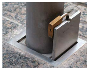
Stainless steel flip lid socket.