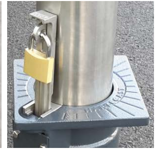
➤ HC101R Retention Socket