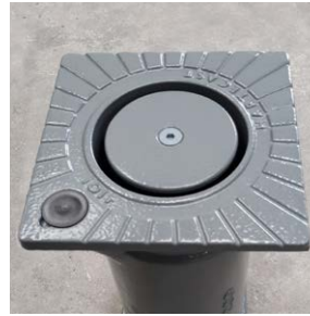
➤ HC101F Retention Socket