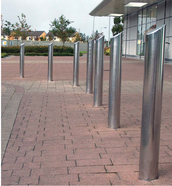
➤ HC2060 Bollard