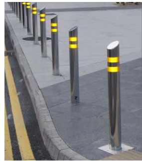
➤ HC2060 With reflective strips