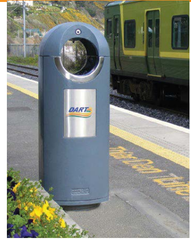
With Advertising Panel