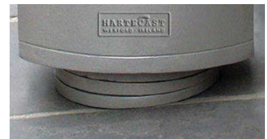
Optional Levelling Plates instantly level the bin on different street gradients