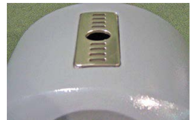
Stubber Plate and Ash Hopper