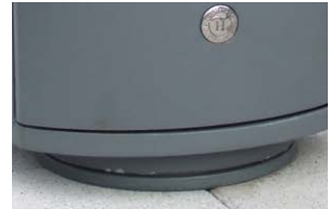
Optional Levelling Plates instantly level the bin on different street gradients.