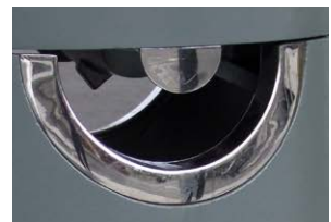
Stainless Steel Rim with optional Restrictor Plate to restrict domestic waste from being deposited.