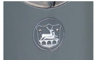
Town logos can be incorporated if required.