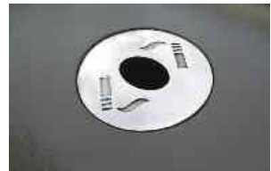
Stubber Plate and Ash Hopper.