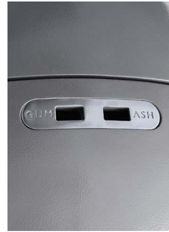
► Colour Options