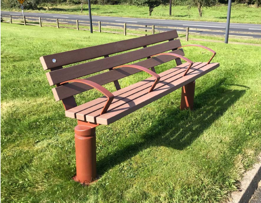
➤ HC2035S Seat with 4 armrests