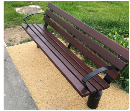
➤ HC2035S Standard Seat with 2 arm rests