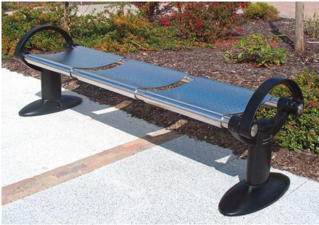
➤ HC2031B Bench