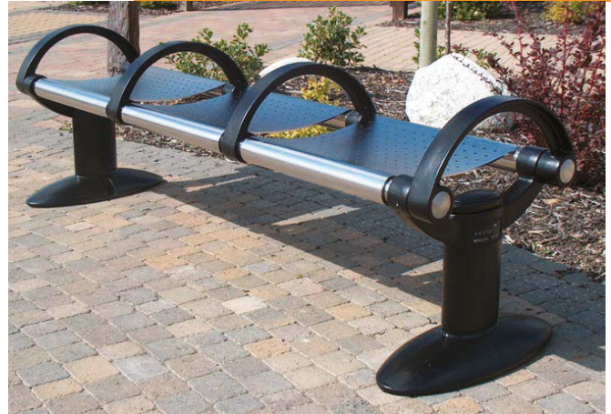
➤ HC2032B Bench with dividing arms