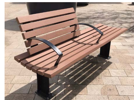
HC2026C Combo Seat with optional arms