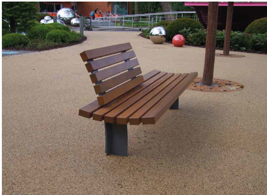
HC2026C Combo Seat