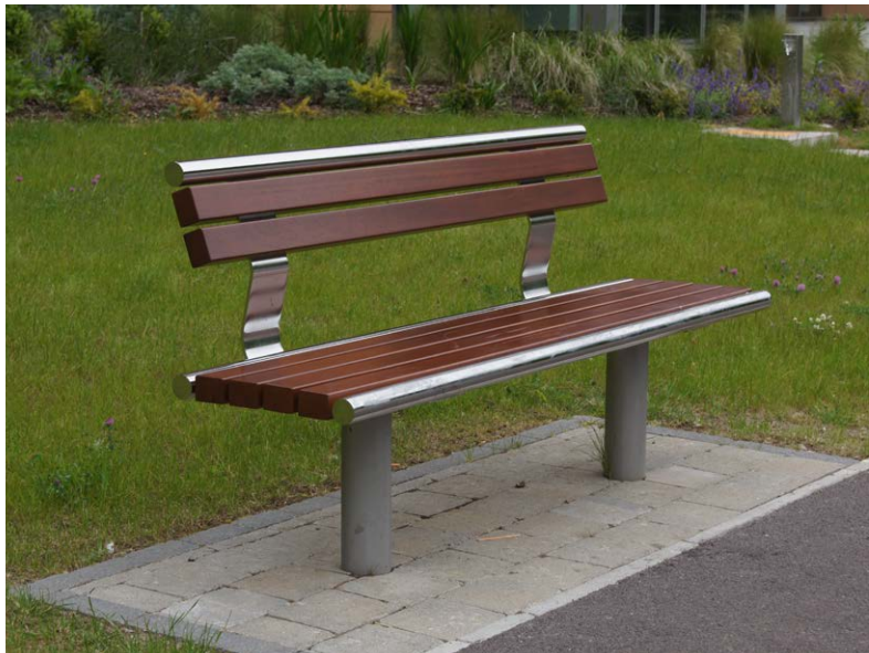
➤ HC2024S Seat