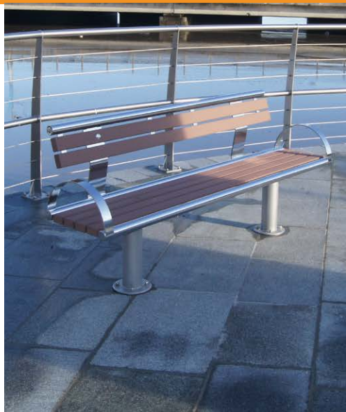
HC2024S Seat with optional arms