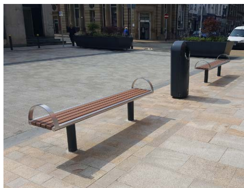
HC2024B Bench with optional arms