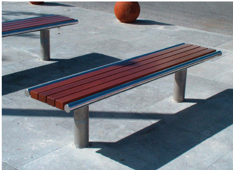
➤ HC2024B Bench