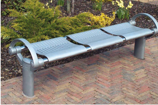
➤ HC2020B Bench