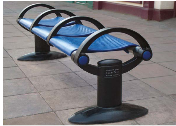
➤ HC2021B Bench