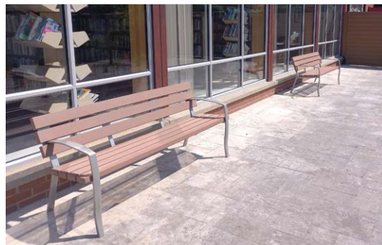
➤ Colour Options