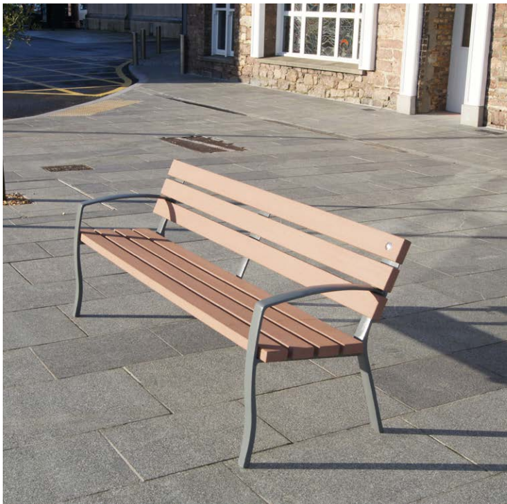
➤ HC2001S Seat