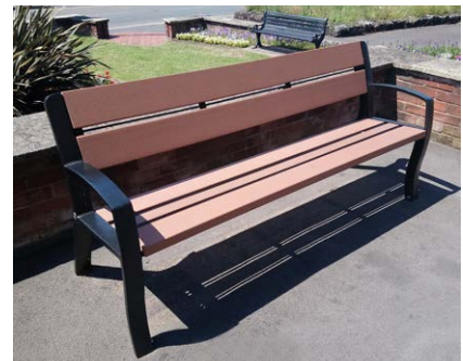
➤ Composite Timber