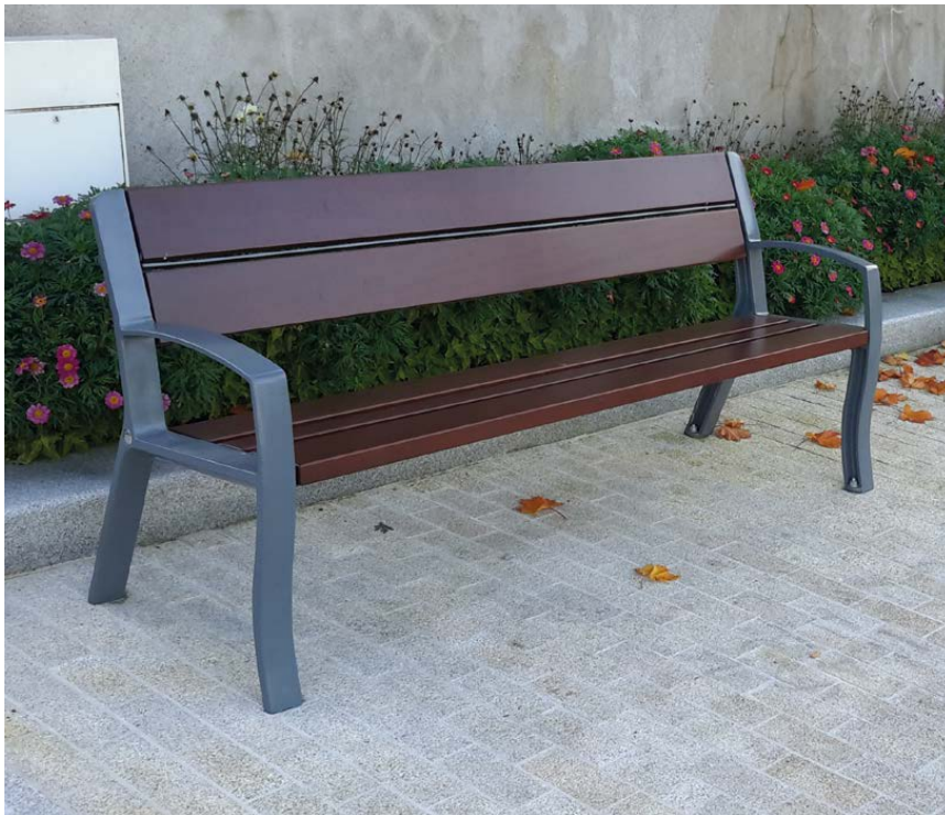
➤ HC2000S Seat