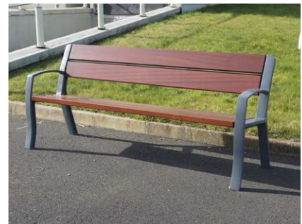
➤ Colour Options