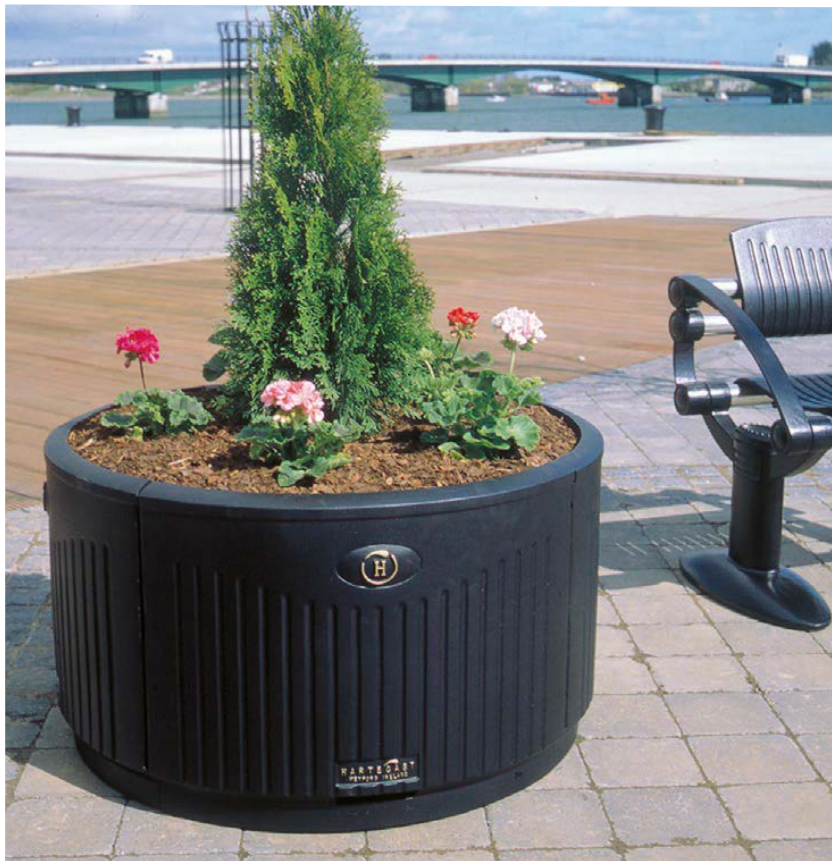
➤ HC200 Ductile Iron Planter