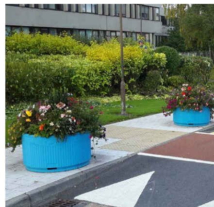
➤ Colour options