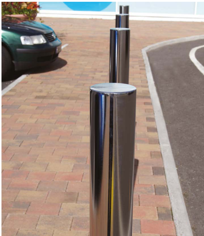
➤ HC2061 Bollard