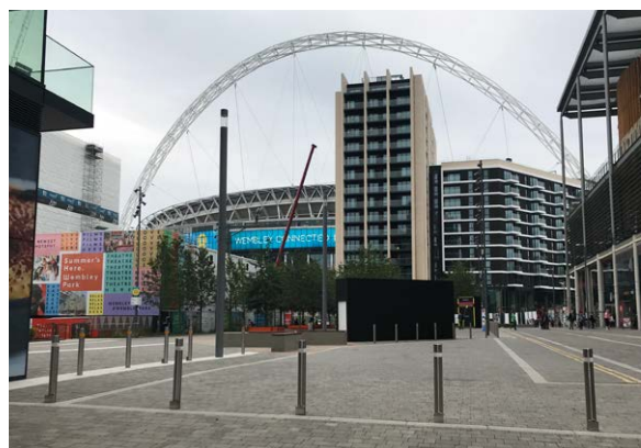
➤ HC2061 Bollard with reflective strips