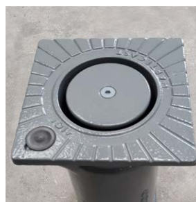
➤ HC101F Retention Socket