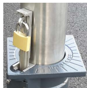
➤ HC101R Retention Socket