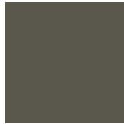
Gris 900 Sable