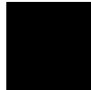
Jet Black RAL 9005