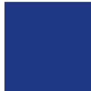
Ultramarine Blue RAL 5002