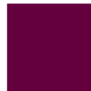
Claret Violet RAL 4004