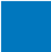
Sky Blue RAL 5015