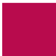
Raspberry Red RAL 3027