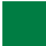
Signal Green RAL 6032