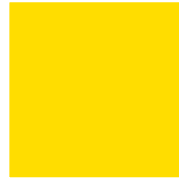
Zinc Yellow RAL 1018