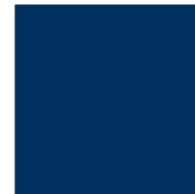
Gentian Blue RAL 5010