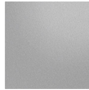
Grey Aluminium RAL 9007