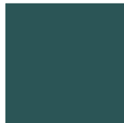
Blue Green RAL 6004