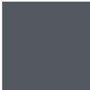
Merlin Grey BS 4800 18B25