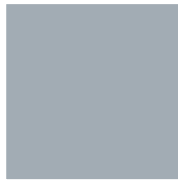
White Aluminium RAL 9006