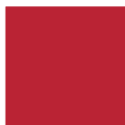
Coral Red RAL 3016