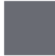
Basalt Grey RAL 7012