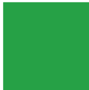
Yellow Green RAL 6018