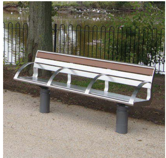
➤ HC2045S Seat with extra dividing arms