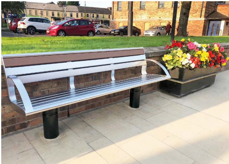
➤ HC2045S Seat